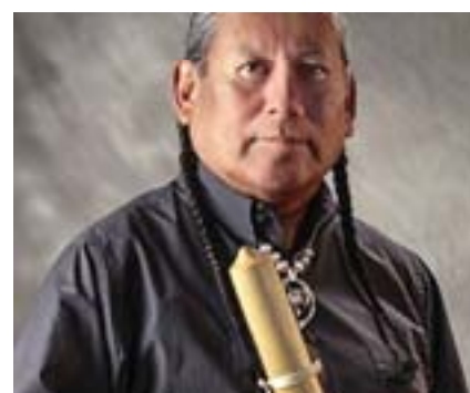
R. Carlos Nakai/Native flute