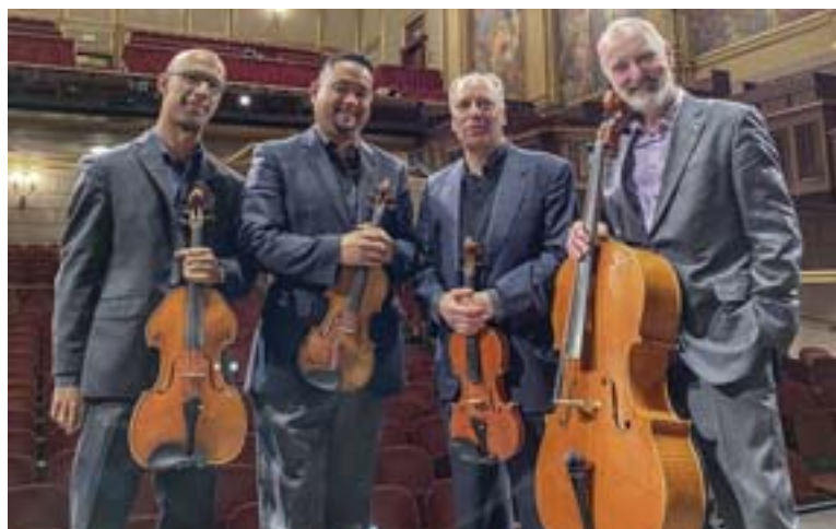
Alexander String Quartet